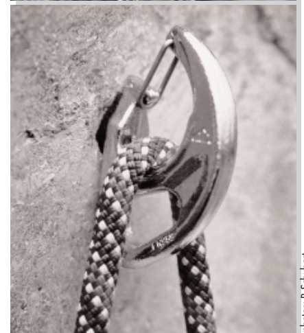
Fig. 4 / 5: Special bolts designed for top-roping: They also make it easier to clip the rope. Fig. 4 shows the DAV "toproping bolt", Fig. 5 shows the STUBAI "IQ-bolt" developed by Heinz Zak.