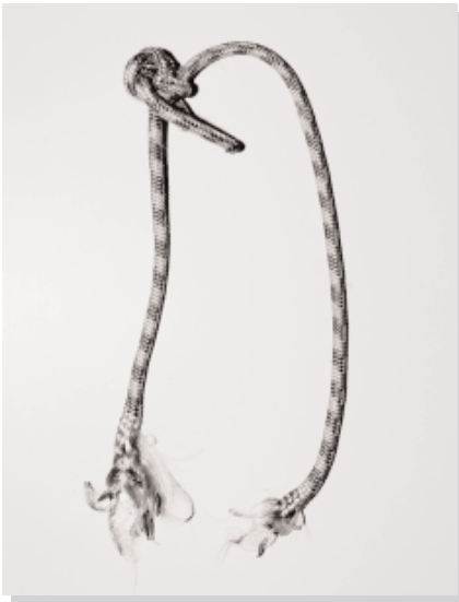
Fig. 2: Sling involved in a fatal accident

speed is higher. These values seem to be significantly lower than those known in practice. The reason may be that frequently the terrain is not quite vertical and so the slings are not loaded with the full body weight. The length of lowering off before breaking may also be significantly larger if the climber's weight is less than 80 kg, or