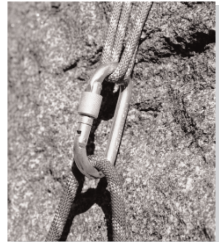
Fig. 3: If a sling is used at the lowering point, the rope has to run through a karabiner with lock mechanism.